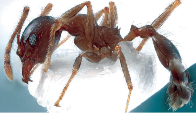
Figure 1: Frontal and lateral views of a minor worker of Pheidole megatron collected by Nsengimana Venuste in July 2019 at 2°3′15.01″ S, 29°47′53.02″ E, at an elevation of 1 826 m, in central Rwanda

(658 bp). Duplicates following the definition of Geneious® were discarded, and a Neighbor-Joining (NJ) tree was constructed with a Tamura-Nei distance model and 1 000 bootstrap replicates. The support threshold for the bootstrap values was set to 75%. Three Pheidole jonas sequences were used as the outgroup to root the NJ-tree.